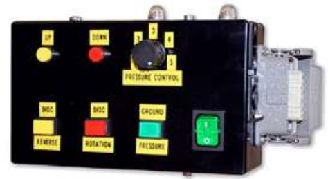
Control panel T21.b