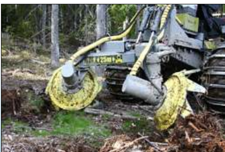
T21.b is mounted on a forwarder of 8 – 11 ton or an agricultural tractor with at least 100 hp