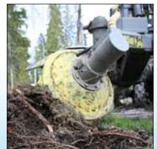
The T21.b is available with hydraulically-powered discs or rotating discs.