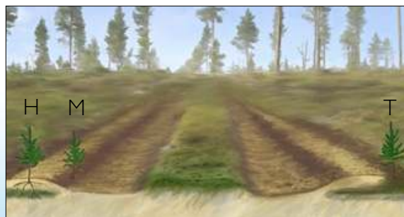
The T21.b creates planting spots with inverted humus (T), mineral soil mounds on inverted humus (H), and mineral soil mounds (M).